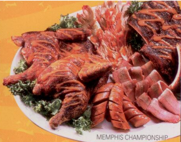
MEMPHIS CHAMPIONSHIP BARBECUE