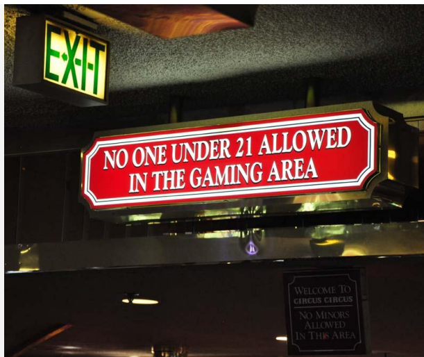
No Minors allowed in gambling areas of Circus Circus

I hesitated at first, but forced myself to go through that front door. The place seems smaller in this millennium, given that it is now surrounded by so many newer, bigger Strip properties. The first thing of notable interest was a very large sign that warned minors must keep out of the gambling areas. I'd like to personally take credit for that.